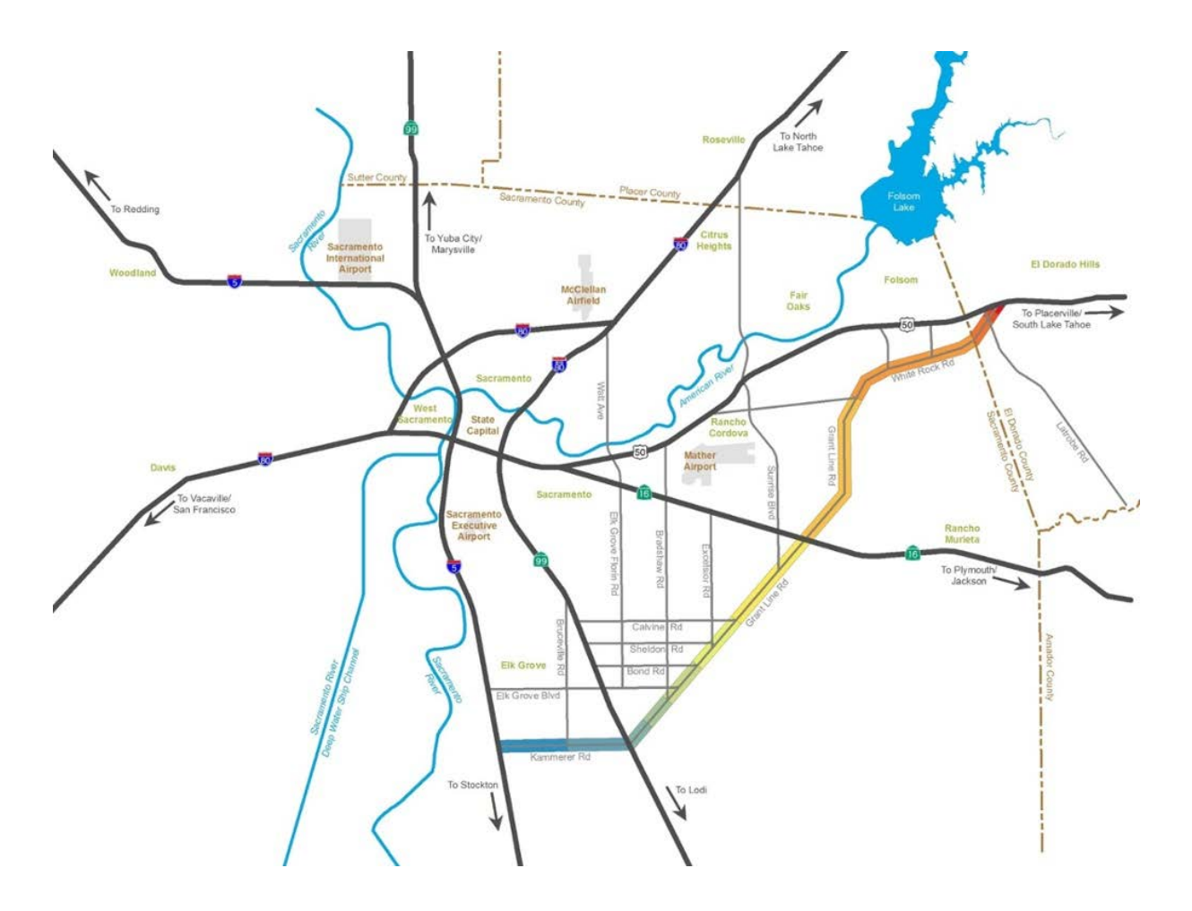
Figure 1. Project map

The Capital SouthEast Connector (Project) will cover the area starting from the interstate 5/Hood-Franklin Road interchange in southwest Sacramento County and terminating at US Highway 50 in the vicinity of Silva Valley Parkway approximately 3 miles past the El Dorado County line. It is expected to provide 4-6 lanes to accommodate existing vehicle traffic and create new multi-modal options.